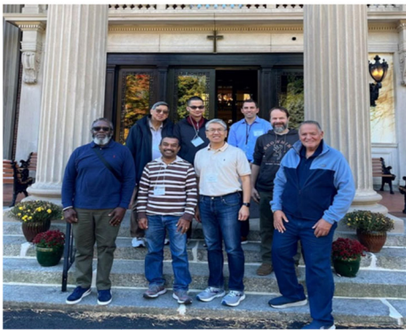
MEN of St. Matthias who lived their Cursillo Weekend at the Loyola Retreat Center, Fall 2024

The gospel this Sunday is the healing of blind Bartimaeus who tried to get the attention of Jesus. In the midst of the crowd, Jesus called him and wanted him to articulate what his need was. Bartimaeus who had lots of things in his mind (unhappiness and all other feelings due to his inability to see and manage his life as he was a blind beggar), got a chance to share his needs with Jesus. Like Bartimaeus, we must seek Jesus with trust in his goodness and mercy. Sometimes our fears, anger and habitual unhealthy habits prevent us from approaching God in prayer. At times, we even become angry with God when He seems slow in answering our prayers. In these desperate moments, let us approach Jesus in prayer with trusting Faith as Bartimaeus did and listen carefully to the voice of Jesus asking us: "What do you want me to do for you?" Let us tell Him all our heart's intentions and needs. Let us imitate Bartimaeus, the man of faith and vision, a man unafraid to recognize his need for healing and to cry out, "I want to see!"